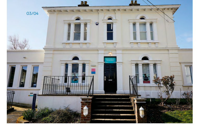
Diplomat House Dental Clinic, Dorset